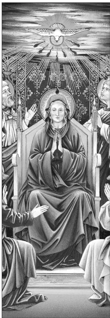
“The Descent of the Holy Ghost,” watercolor by Dias Tavares.