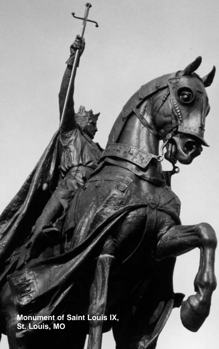
Monument of Saint Louis IX, St. Louis, MO